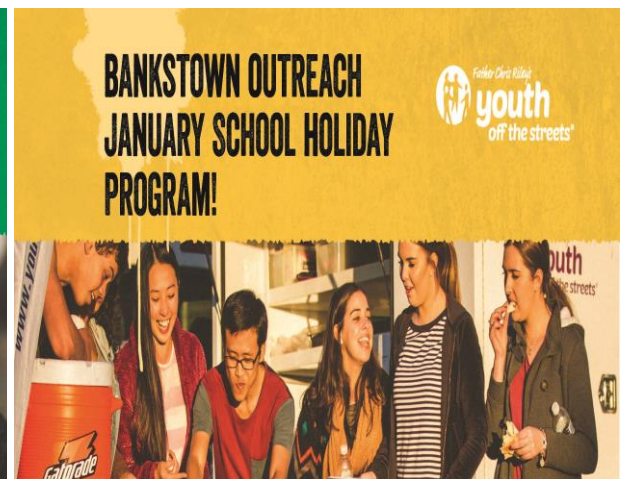
Youth Off The Streets Bankstown Outreach school holiday calendar January 2018! Check the activities below and book your place now!